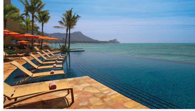
Soak up the warm, Hawaiian sun as you stay in 3 ocean-side resorts: the Sheraton Waikiki, Sheraton Kauai Coconut Beach Resort and Westin Maui.

DAY 9 Breakfast. Free day to enjoy the beach & Maui. Farewell dinner at the Wailele Polynesian Luau at the Westin Maui.